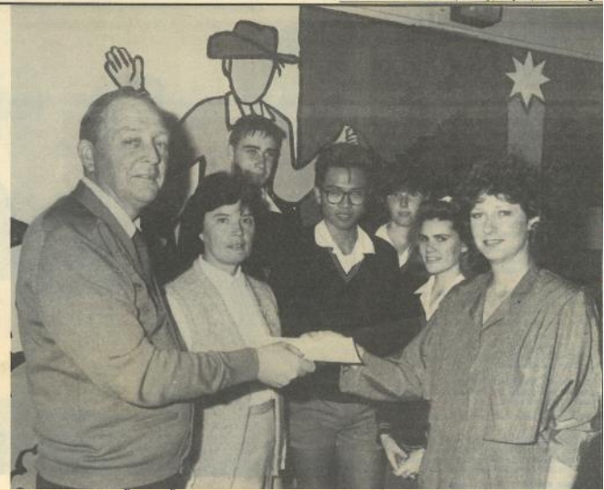
The Gladstone Observer, Friday, July 22, 1988 — Page